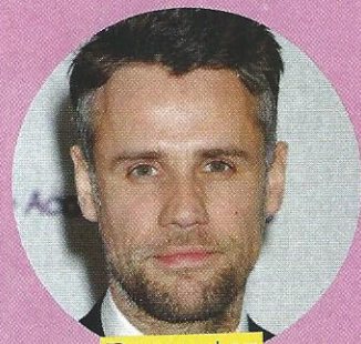
Presenter RICHARD BACON