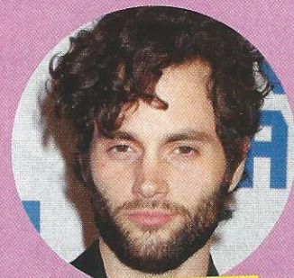
Gossip Girl actor PENN BADGLEY